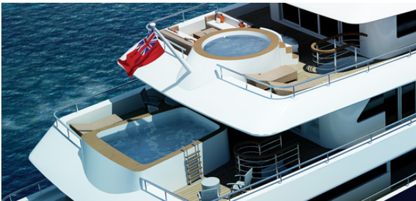
3. Owner's Jacuzzi and upper deck mini-pool