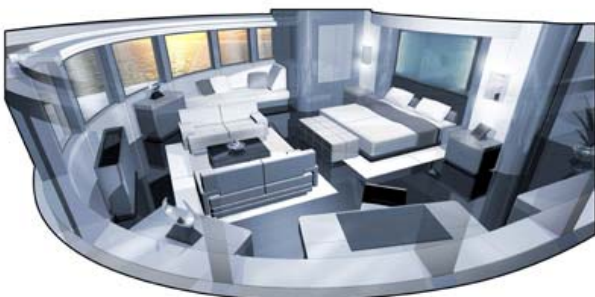
5. Master stateroom