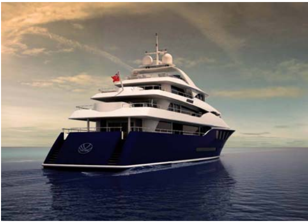
1. Stern view