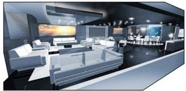
6. Main saloon