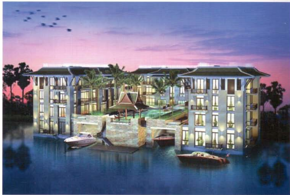
Royal Phuket Marina, or RPM