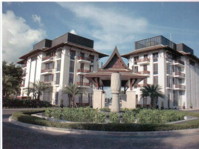
Royal Phuket Marina